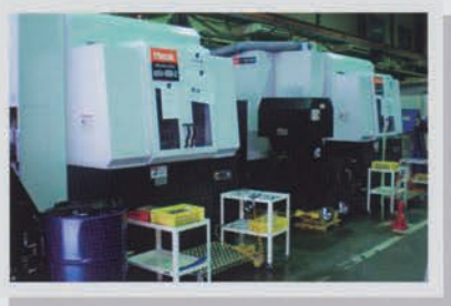
Horizontal machining center

Owens machining center 26 units, can be processed maximum up to 450 mm square. We have 10 units 5-sided machining corresponding equipment by one chucking out of 26 cars which able to achieve high relative accuracy. In addition, we also can shorten the program and setup time, processing cycle time of long products with the best equipment. We will exert the strengths of communication industry, semiconductor, and industrial equipment relationship.