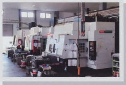
5 axis process machine

There are 6 units of lathe, 6 units machining in 5-axis machine. Current, we correspond to turn one chucking 5-sided machining, simultaneous 3-axis machining within 450 mm square in the center size within \Phi 400 mm. Since the introduction a decade ago, we have been advancing everyday to build ultra fine processing technology. For each requests from customers such as communication, semiconductor, especially in the industrial equipment industry, we select the most appropriate equipment to achieve shorter lead time and a stable quality.